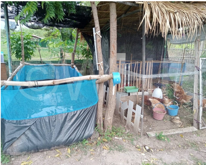
Self-sufficiency - fish, chicken, and eggs

For building sustainability, we have given financial aid to families and groups to start self-sufficiency projects. There were those who had lost their jobs in Bangkok and had to return to their hometowns. Many families and groups are actively producing their own food and giving to their neighbors, and some are selling the extra for additional family income. Your generosity is going a long way in blessing the needy and hungry.