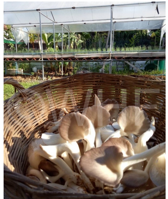
Self-sufficiency - mushrooms and more

Tenacity and fortitude are what we need during such a time as this. We have also begun our own production of organic nano fertilizer and photosynthetic organisms. We plant our own corn, cucumbers, pumpkins, long beans, basil, lemongrass, spring onions, gourds, limes, chillies, choy sum, kangkong, and of course, rice.