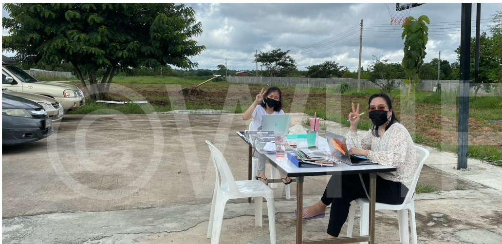
Supervisors doing online conferences in an open area

The Harvest Learning Center team is continuing to look to God for wisdom and for creative ways to train and educate our students during this time when Thailand has implemented a nationwide mandate closing all schools, including kindergartens. We are meeting our students online individually and in groups, and we are meeting students for occasional personal and small group meetings here at our offices and in their homes. It is especially difficult to find safe and appropriate ways to provide online training for our kindergarteners, and it is impossible to provide anything similar to our normal English immersion environment for our new primary students; and of course all of our students are forced to study at a slower pace than usual. But in spite of the obstacles, everyone is making the best of the situation, and everyone is praying that we will soon be able to reopen all of our programs.