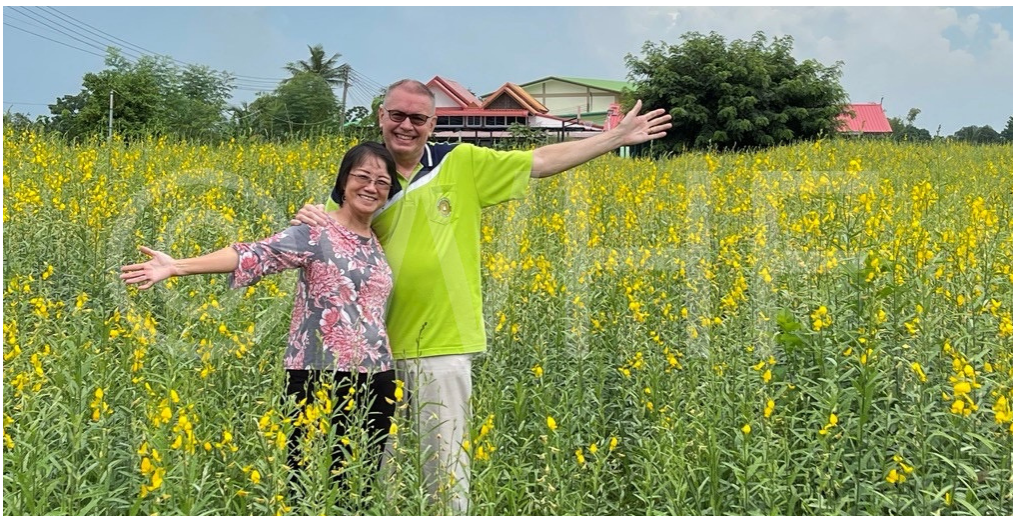
Sun hemp (for soil building) in full bloom in August 2021

Much has happened in the last three months. We see God showing up at almost every turn and we are honored to be here amid the swirling storm. It is here that we get the opportunity to feel the excitement in the air as we count His blessings one by one. We choose faith to overcome fear and we choose to be overcomers during this challenging time. Thank you for journeying with us all these years and we look forward to even more exciting times ahead. Our God never fails.