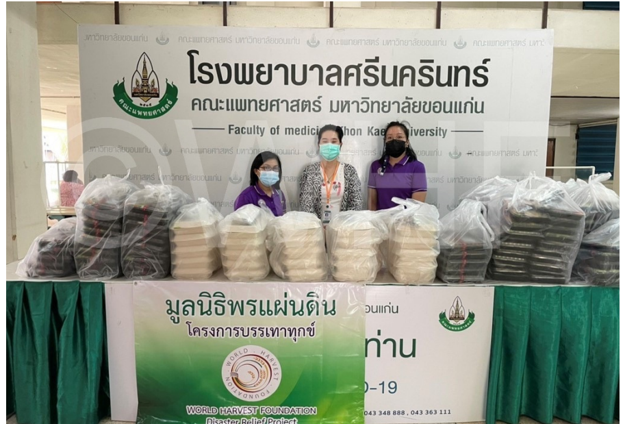
Our token of appreciation to frontline workers at Srinakarin Hospital

For building sustainability, we have given financial aid to families and groups to start self-sufficiency projects. There were those who had lost their jobs in Bangkok and had to return to their hometowns. Many families and groups are actively producing their own food and giving to their neighbors, and some are selling the extra for additional family income. Your generosity is going a long way in blessing the needy and hungry.