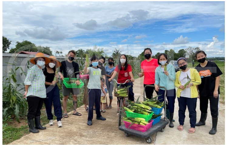
We harvested more than 400 ears of corn from this planting season

Much has happened in the last three months. We see God showing up at almost every turn and we are honored to be here amid the swirling storm. It is here that we get the opportunity to feel the excitement in the air as we count His blessings one by one. We choose faith to overcome fear and we choose to be overcomers during this challenging time. Thank you for journeying with us all these years and we look forward to even more exciting times ahead. Our God never fails.