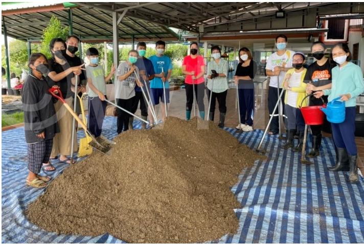
Building community and having fun making Organic Nano Fertilizer