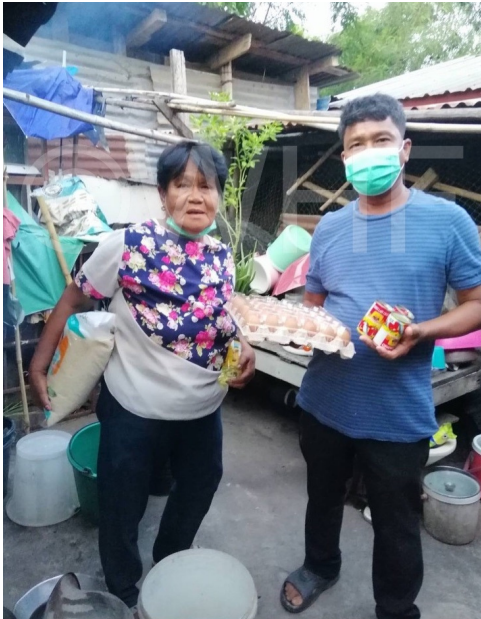
Delivering food to vulnerable families