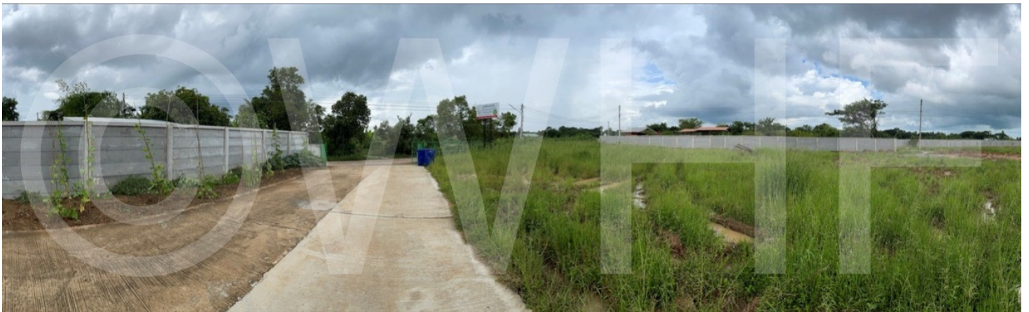
Panoramic view of the completed security wall taken from inside our foundation on 23 Sep 2021 (frontage of school left to be done)

We are seventeen years old as a foundation. On September 21, 2021, World Harvest Foundation celebrated another anniversary! We recounted God's faithfulness to us in the 17 years since September 21, 2004. We couldn't have pulled this off without all your fervent prayers and support. You are all wonderful and amazing. The most awesome thing in this quarter is to testify that we have the necessary funds ready to see to the completion of the security wall project including the frontage of the school. God is truly good and faithful, but I know that it is also because of dear friends and supporters like yourselves who obeyed radically and gave sacrificially. We are indeed more than blessed, and we are so grateful.