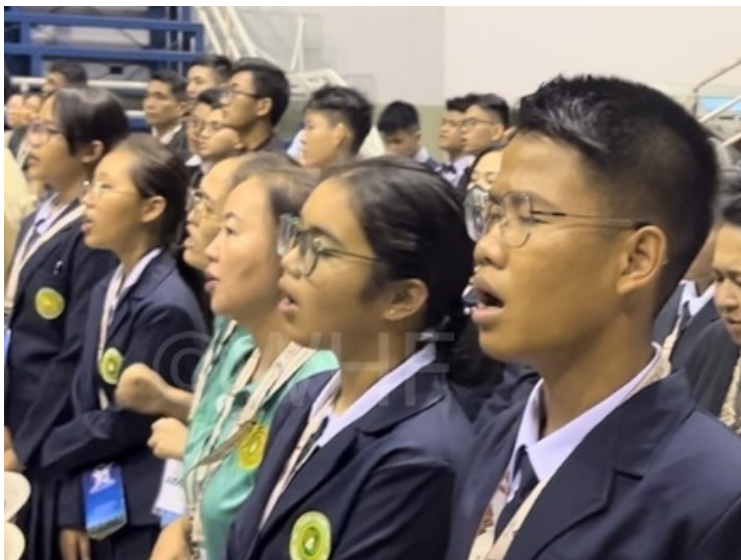
Evening Rally - Worshipping God