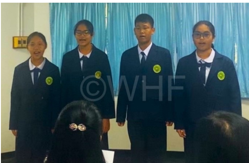
Mixed Quartet - It Is Well With My Soul