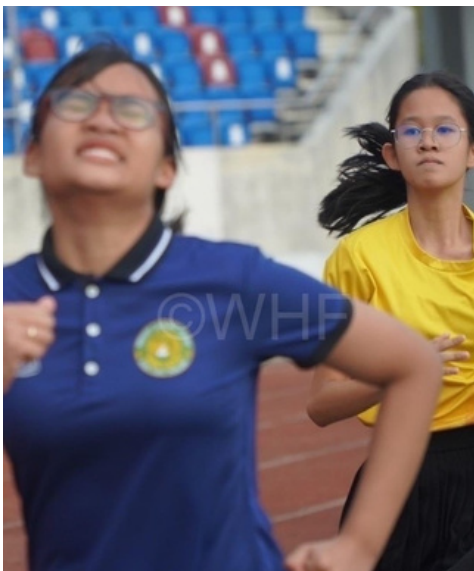
Fair - 1.6-Kilometer Run