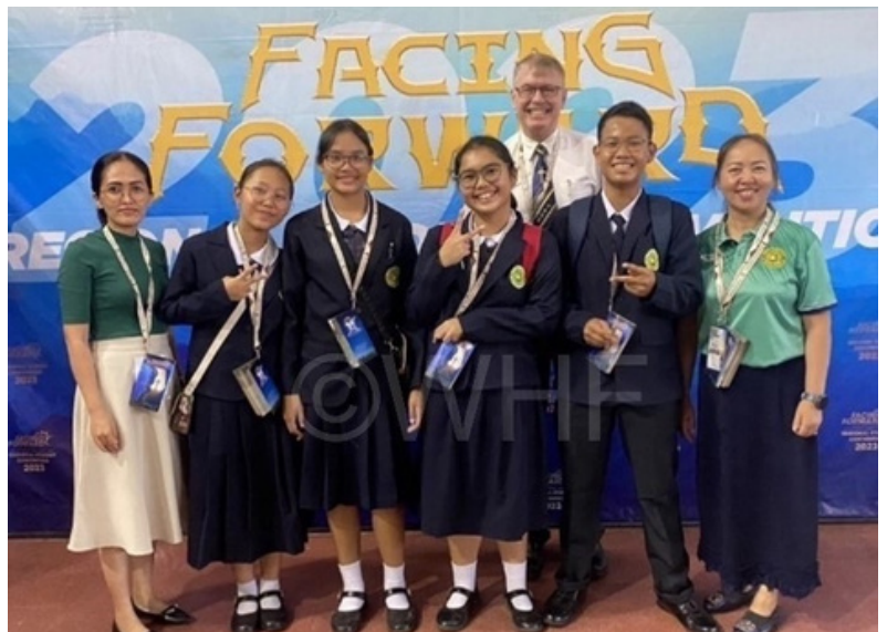
This Year's Theme - Facing Forward