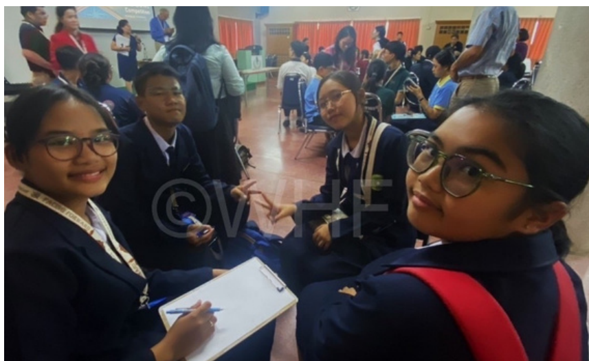
PACE Bowl - Academic Challenge