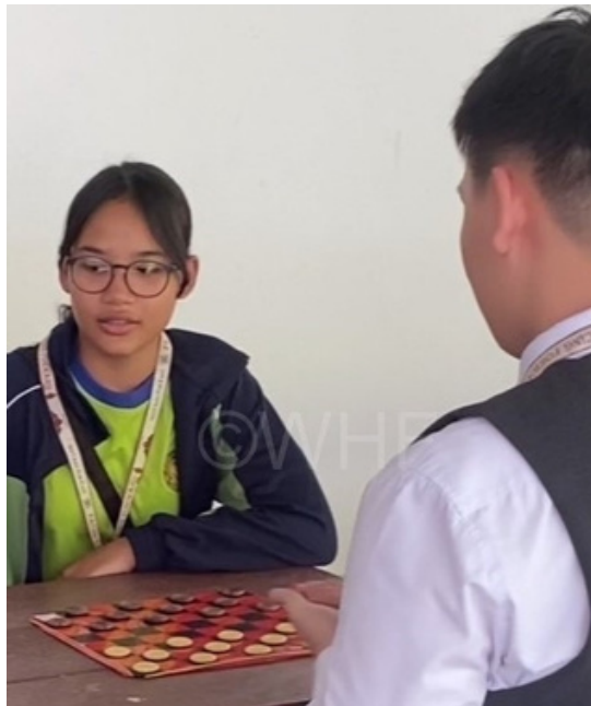
Fair – Checkers Tournament