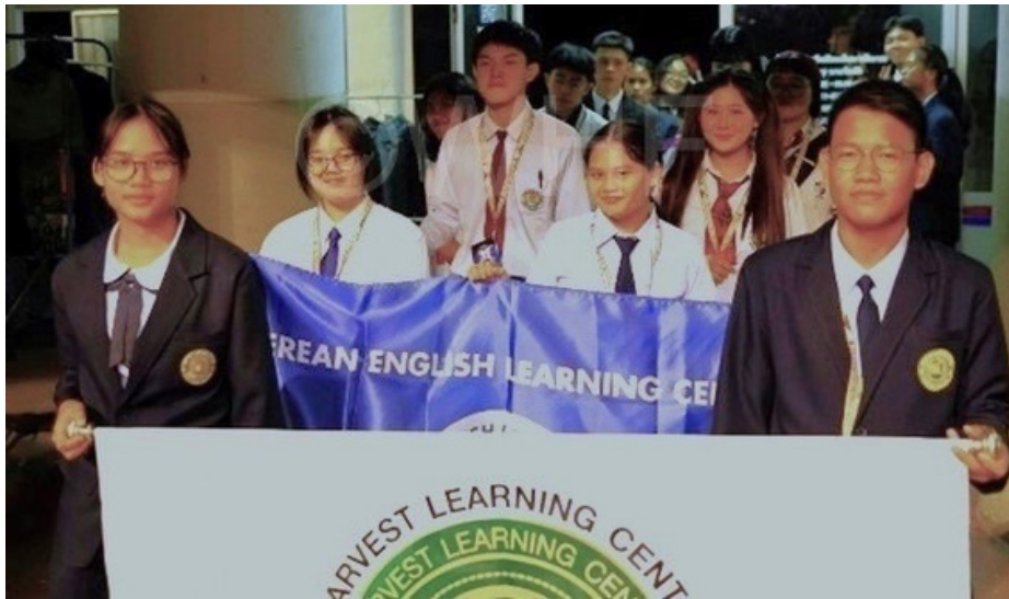
RSC 2023 Chiang Mai Thailand - Parade of Flags